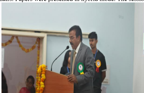
Principal and Dean School of Computing felicitated the Chief Guest with shawl and memento.